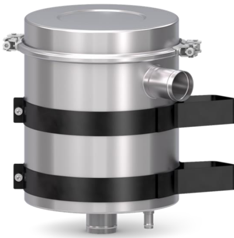
Figure 1: ProVent 2 700 system

ProVent 2 700 systems are designed for both original equipment and retrofit. The following illustrations show possible superstructures and a cross-section of the system.