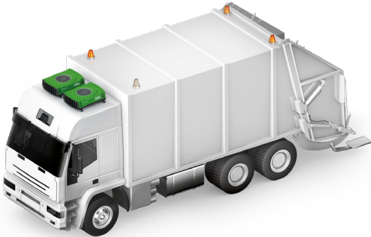
Waste disposal vehicles