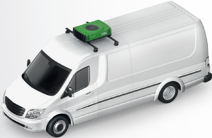
Delivery service vehicles