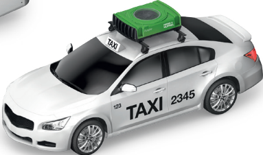
Public transport vehicles: taxi